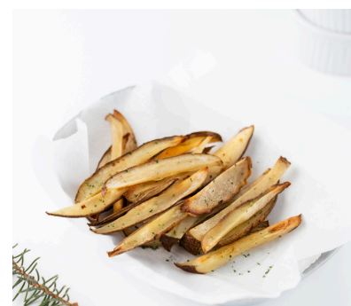
TRUFFLE FRIES Skin-on premium fries, homemade truffle mayo, deep fried crispy onions £6