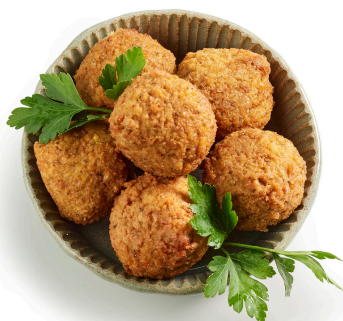
FALAFEL Our signature recipe, served with hummus dip £7