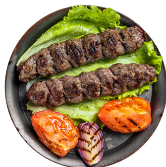
LAMB KOFTA Lamb meataballs mixed with various herbs, spices, and onions £15