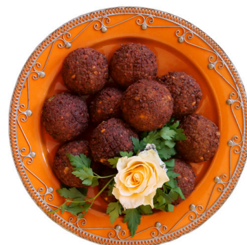
BEETROOT FALAFEL Our signature recipe, mixture of beetroot and chickpeas £7