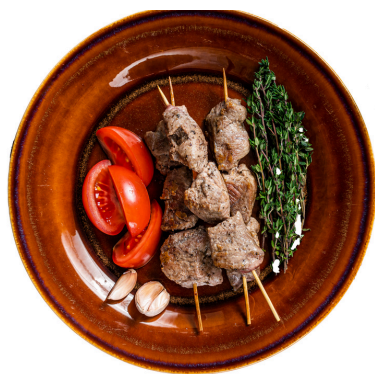
LAMB SHISH Premium lamb marinated in a blend of olive oil, lemon juice, garlic, and assorted herbs and spices £16