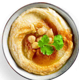
HUMMUS (V) Our daily blend of chickpeas, rich in tahini and spiced with herbs served with Greek pita. £6