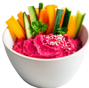
BEETROOT TZATZIKI Our signature recipe made of strained yogurt, olive oil, lemon and herbs £7