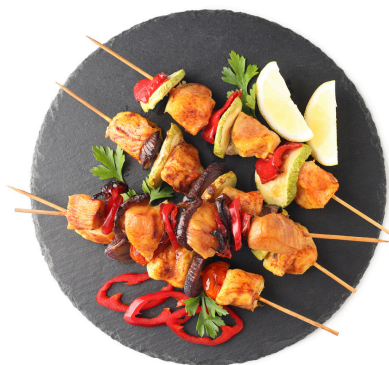
CHICKEN SHISH Free range chicken breast marinated in a blend of olive oil, lemon juice, garlic, and assorted herbs and spices £15