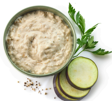
BABA GHANOUSH Grilled aubergine, chickpeas, tahini, olive oil infused with lemon juice and garlic £7