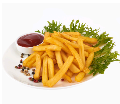
CAJUN FRIES French fries seasoned with Cajun spices, including a blend of paprika, garlic powder, etc £5