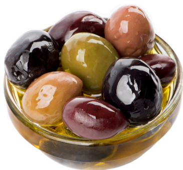
MIXED OLIVES Flavored with herbs with olive oil £6