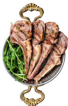
LAMB CHOPS Grilled lamb meat seasoned with herbs, spices £18