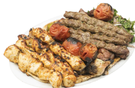
MIXED GRILL (FOR 2/4/6) Variety of grilled meats, served together on a single platter £29/£55/£75