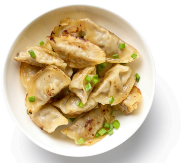
MANTOO Afghan dumpling dish that is typically filled with seasoned ground meat, usually beef or lamb, and onions £9