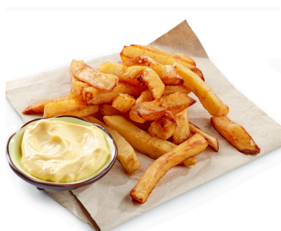
GARLIC MAYO FRIES Skin-on premium fries, homemade confit garlic mayo, deep fried crispy onions. £6