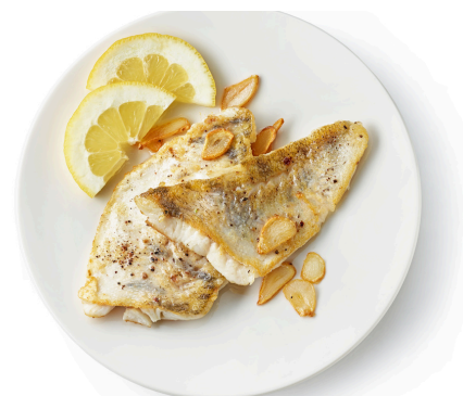
SEABASS Grilled sea bass marinated in our homemade marinade with assorted herbs and spices, £15